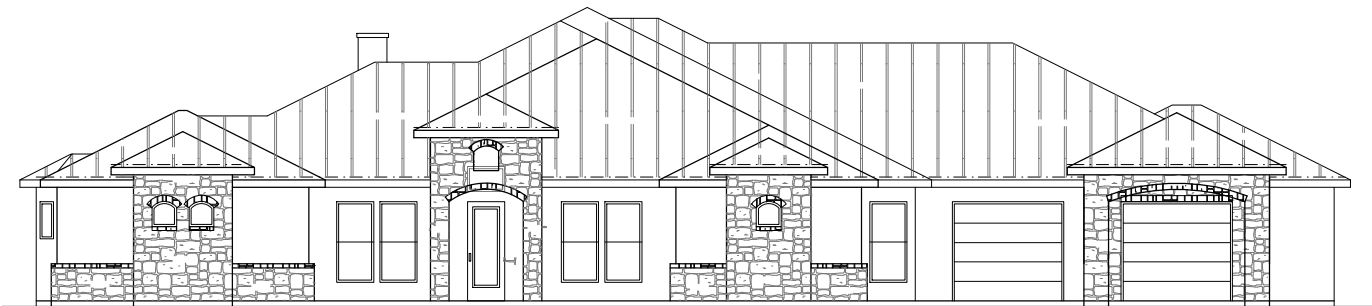
FRONT ELEVATION NOT TO SCALE