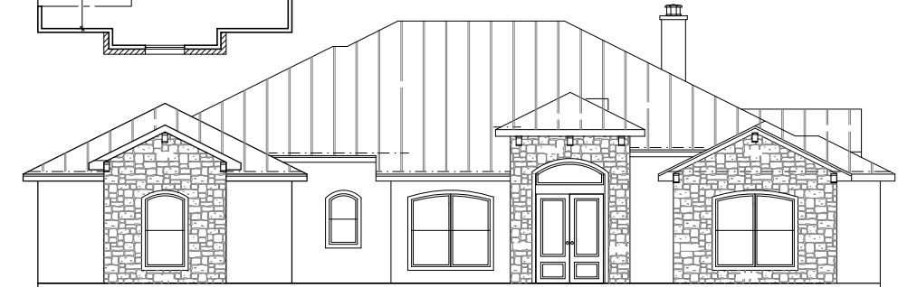
FRONT ELEVATION NOT TO SCALE