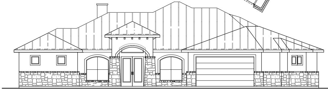
FRONT ELEVATION NOT TO SCALE