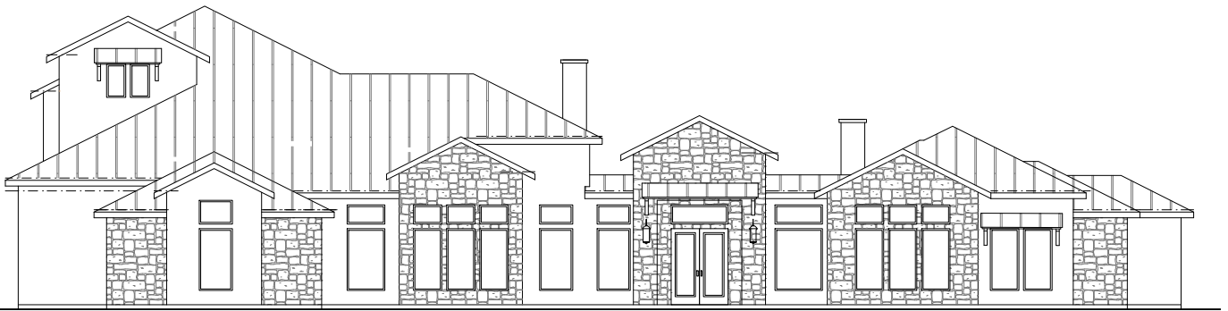
FRONT ELEVATION NOT TO SCALE